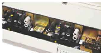
Two print modules